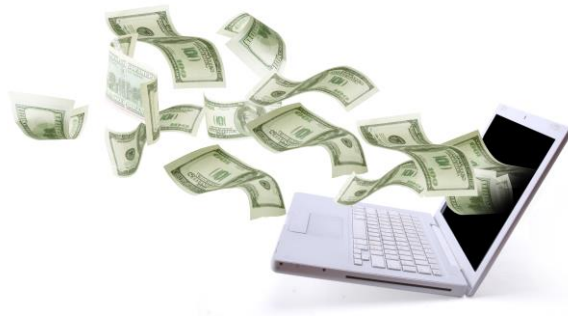
Figure 1 below offers a glimpse into the financial reality of manual testing. To be able to illustrate such costs we have had to make a number of assumptions:

The other option here is to allow a third party offshore test agency to do your testing for you. High agency fees plus a lack of control could make this a difficult decision.